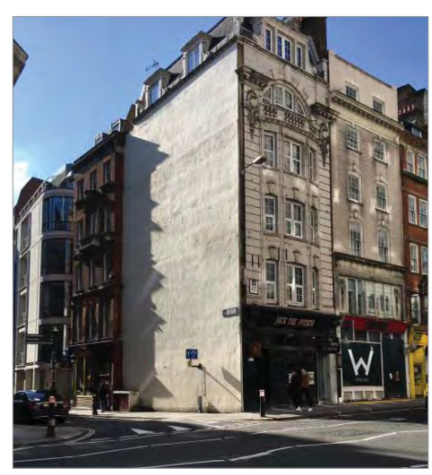
Fig. 1. The junction of Fleet Street and Bouverie Street.

It took some years to find out why there were no windows in the large blank wall. The answer was that there had originally been another building alongside the wall, covering about half of what is now the entrance to Bouverie Street. Old maps show Bouverie Street narrowing down to eight feet or so at the junction with Fleet Street (Fig. 2).