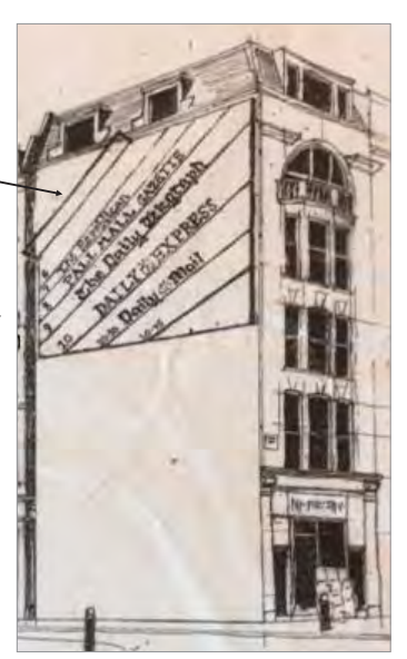
Fig. 4. A draft design for the sundial at the top half of the wall.

Number 62 Fleet Street stood on this site until it was pulled down to widen Bouverie Street in the late 1800s. It was the printing office of Richard Carlile who published The Republican here from 1819 to 1826. He was present at the Peterloo massacre in 1819, and published the first report of it in London. Carlile also published The Rights of Man and other books by Thomas Paine. The Government attempted to shut down The Republican on many occasions and Carlile was prosecuted and sent to prison three times.