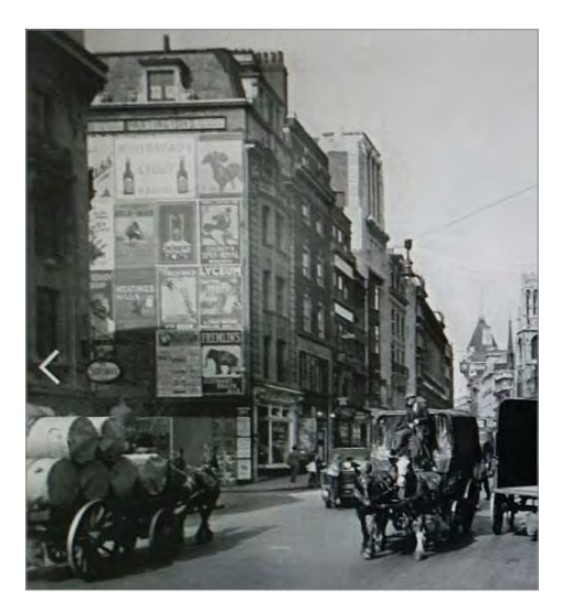
Fig. 3. Fleet Street in the 1930s (Museum of London).

Around 150 years ago, the City had one of its periodic campaigns to widen Fleet Street, and, at the same time, decided to widen the access to Bouverie Street by purchasing and demolishing 62 Fleet Street. The current building numbered 62 seems to have been built at the back of no. 61. However, the reason for the absence of windows is that the City did not need the whole site of the original no. 62. There was a strip about a foot wide which was surplus to their requirements. This strip can be seen on the ground as a separate lighter colour against the squares of the pavement. The title deed of the new 62 incorporated this strip, extending all the way to Fleet Street. Thus, the wall is not the exterior wall of no. 61, but the party wall between 61 and 62